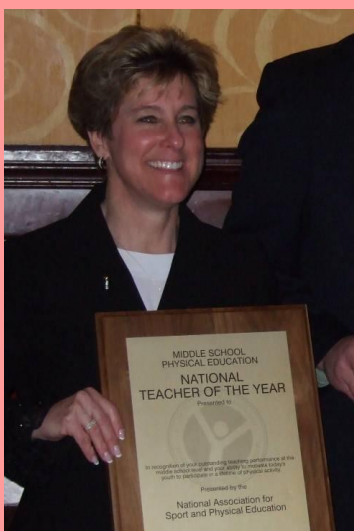
NASPE Hall of Fame Banquet

Being named the 2008 National Middle School Physical Education Teacher of the Year is a prestigious honor. This award is the highlight of my career. To be a part of the National Association of Sport and Physical Education (NASPE) family is truly a unique experience as they are supportive in their professional roles and advocate for high quality Physical Education programs across the country. I enjoy presenting and sharing ideas with other teachers. As a Teacher of the Year I also hope to learn new and innovative ways to continue to inspire my students and to give back to the profession through advocacy for quality Physical Education.